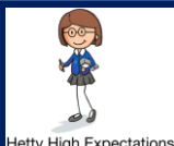
Hetty High Expectations