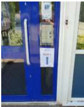
Children enter via main entrance