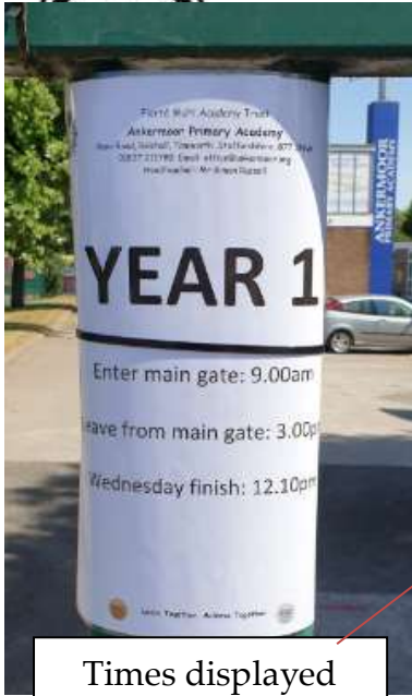
Times displayed outside school