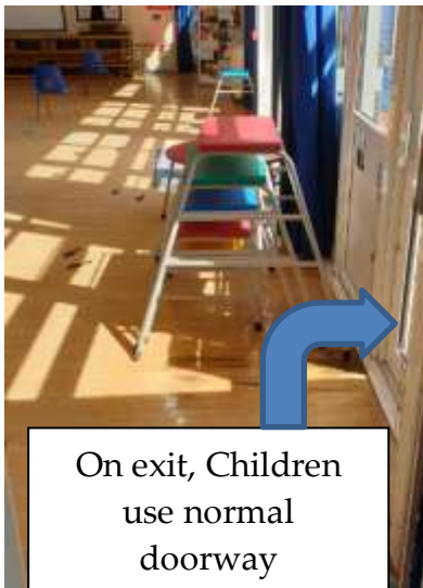
On exit, Children use normal doorway