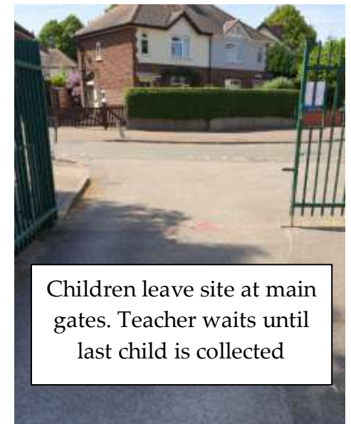
Children leave site at main gates. Teacher waits until last child is collected