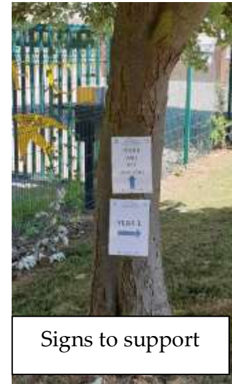
Signs to support