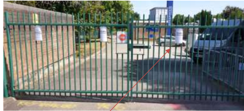
Child to enter at main gate at 9.00am independently