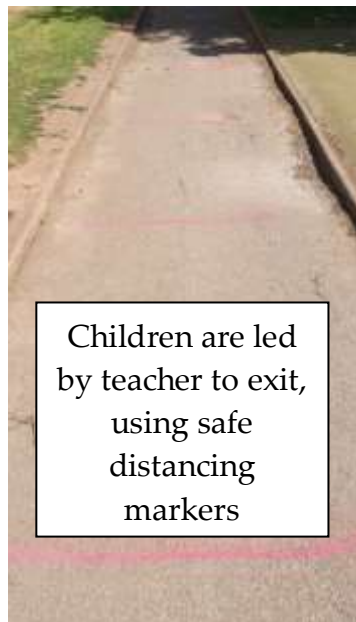
Children are led by teacher to exit, using safe distancing markers