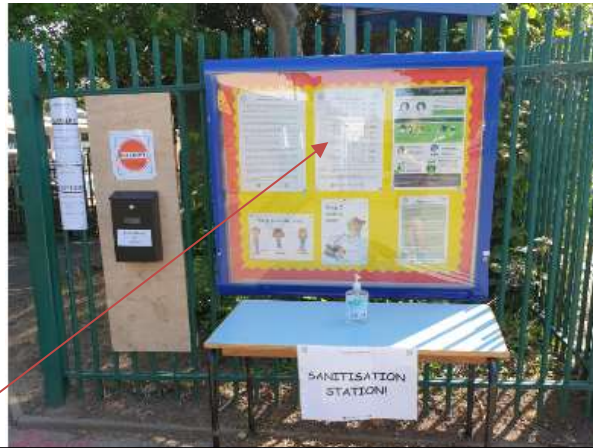
Signs to help with parent understanding and an area to sanitise