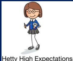
Hetty High Expectations